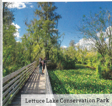
Lettuce Lake Conservation Park

WHEN YOU THINK OF THE FLORIDA LANDSCAPE , you might think of palm trees and beaches. Here in Tampa Bay, in addition to the stunning Hillsborough River, we're surrounded by the beauty of botanical gardens, parks and green spaces that showcase the area's flora and fauna. Here are a few of the best spots to commune with nature, without ever leaving the city.