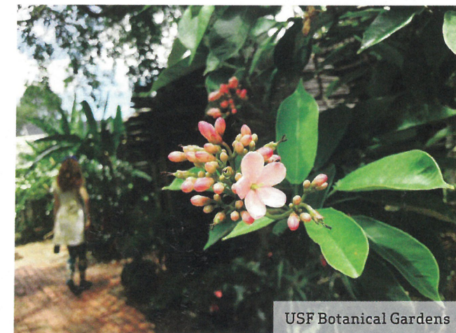
USF Botanical Gardens

between blooms in the butterfly garden and carnivorous plants set their traps for insects. Fruit trees, palms, bromeliads and a medicinal garden also flourish here. And don't miss the extensive collection of orchids.