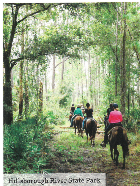
Hillsborough River State Park

Just west of I-75 along a curve of the Hillsborough River lies Lettuce Lake Conservation Park . Cypress trees, ferns and oaks draped with Spanish moss make you feel like you're in the heart of Old Florida. Enjoy the peaceful vibe as you stroll down the boardwalk, then climb an observation tower to try to spot turtles and alligators dozing in the sun.