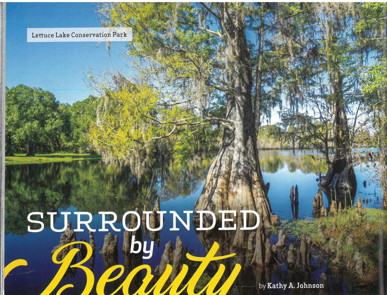
Lettuce Lake Conservation Park