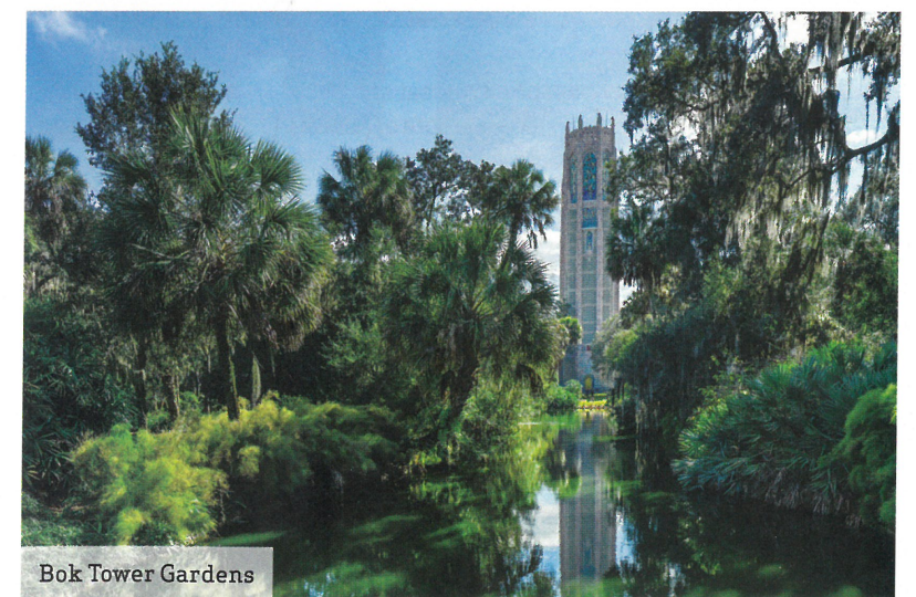
Bok Tower Gardens

Down the road between Tampa and Orlando, Bok Tower Gardens boasts 50 acres of gardens designed by landscape architect Frederick Law Olmsted, Jr. Paved or mulched pathways meander through longleaf pines and turkey oaks, through quiet spots and secluded nooks, all the way to the 205-foot-tall, Art Deco/neo-Gothic Singing Tower carillon (30-minute concerts take place at 1pm and 3pm). Against a background of ferns, pines, oaks and palms, something is always blooming—azaleas, camellias, magnolias or even giant Victoria water lilies. 🌸