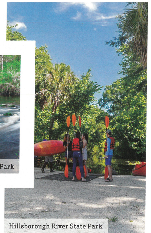
Hillsborough River State Park