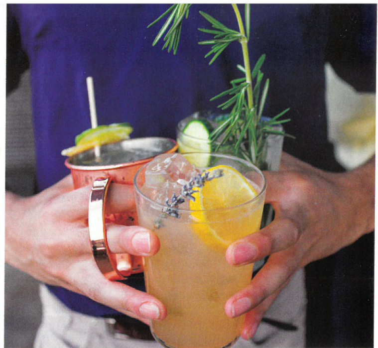
Luna Lounge by Bulla

So now that you're thirsty, where should you sample all these delicious creations? Sure, you could go to an "ordinary" restaurant or bar, but why not combine Tampa Bay's uniquely crafted brews and cocktails with an equally unique setting—a breezy rooftop bar-with-a-view? Sample some of Tampa Bay's best rockin' rooftop lounges and take in spectacular skyline and sunset views while sipping the latest handcrafted creation.