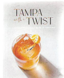
EDGE ROOFTOP COCKTAIL LOUNGE & COCKTAIL: EPICUREAN HOTEL; EDGE BARTENDER: AMY PEZZICARA

If you don't want your cocktail experience to end, be sure to pick up a copy of Tampa with a Twist while you're in the area. This beautiful, full-color book showcases recipes from some of Tampa's leading bartenders, so you can up your cocktail game at home! Find it online or at the Unlock Tampa Bay Visitors Center.