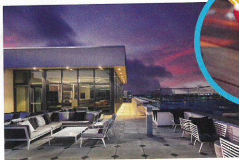
Rox at The CURRENT hotel